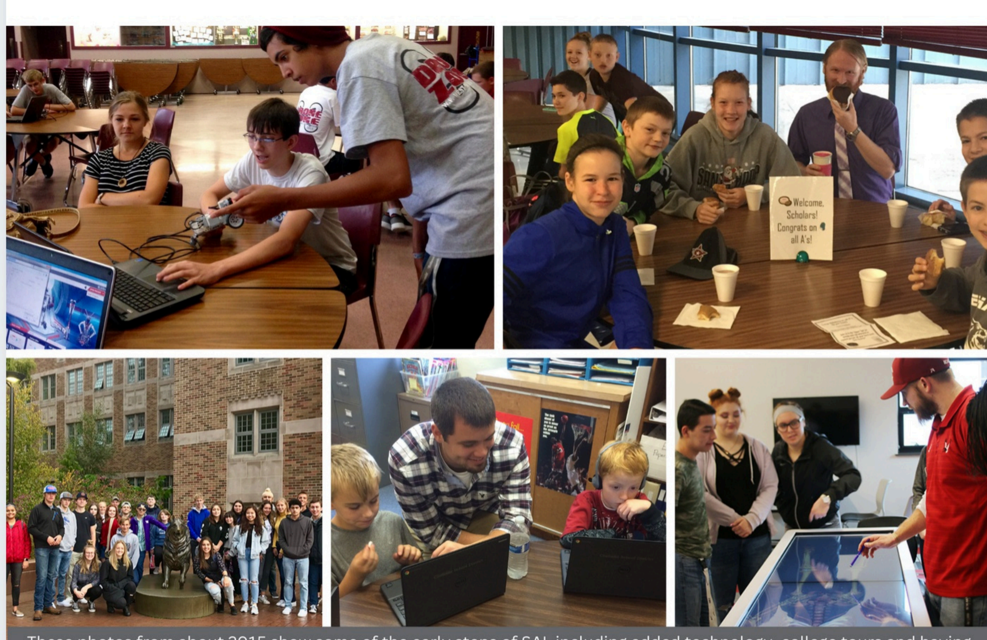
These photos from about 2015 show some of the early steps of SAI, including added technology, college tours and having career and college readiness conversations at all grade levels.

Check out media coverage about the Student Achievement Initiative, WSAC Grant and other exciting honors for the Chehalis School District here.