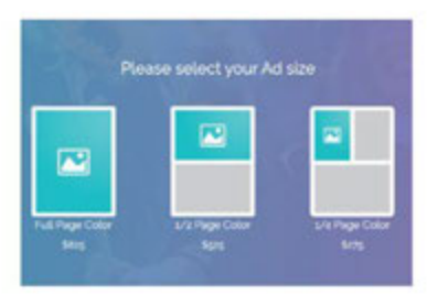
Step 1 Choose your ad size and layout