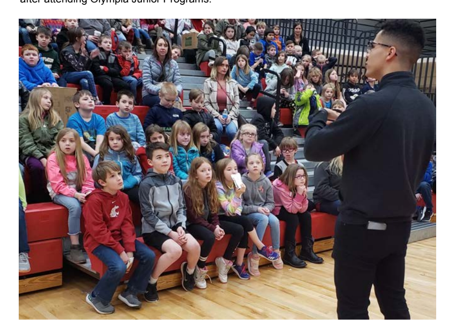
Below are some of our 3rd graders at St. Martin's University learning about the college after attending Olympia Junior Programs.