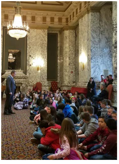
Our 5th graders at the State Capitol learning about the history of the building and touring each area - including where Congress and the state Supreme Court convene. They also got to meet Senator John Braun.